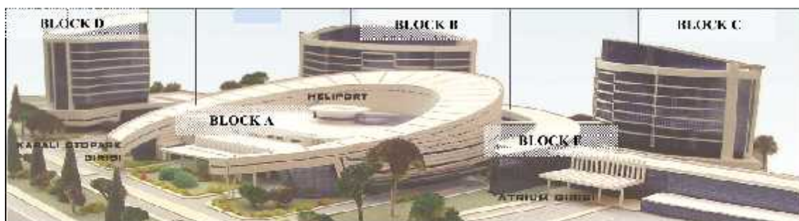
Figure 3. Visualization of the medical campus ( Aymaz Architecure ,2019 )