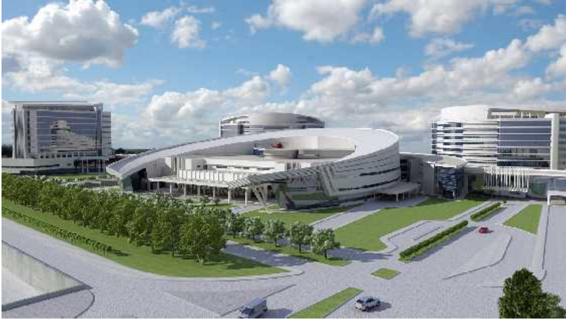
Figure 4. Visualization of the medical campus ( Protamuhendislik, 2019)